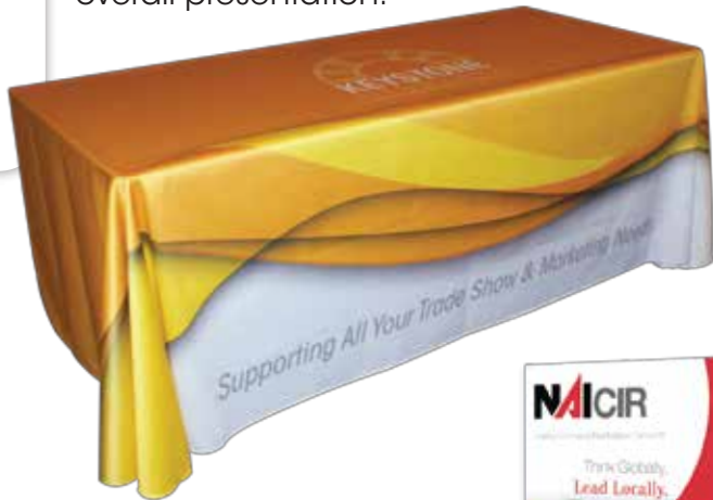
Table Throws complete your space by coordinating with your display to give maximum impact to your overall presentation.