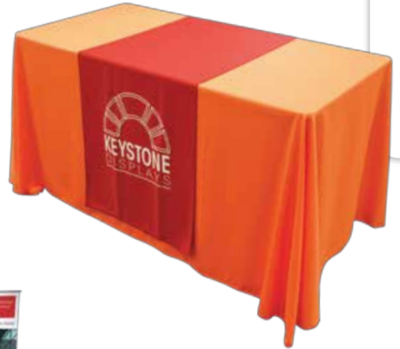
Table Runners are a simple yet effective way to brand your table.