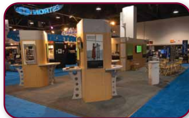
Final design, display at show