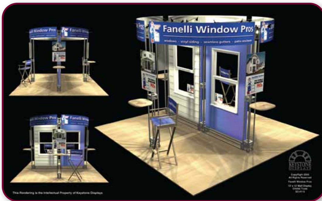
3D rendering of initial conceptual design

Fanelli Window Pros, a family owned business, started as a one man operation in 1978. It has since expanded, offering a full line of services in window replacement, siding, sun rooms, and gutters.