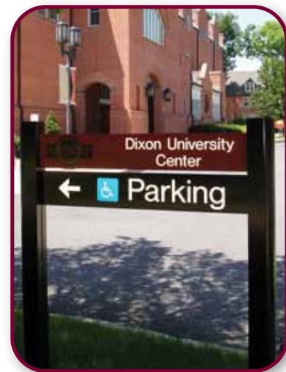
Outdoor post & rail sign