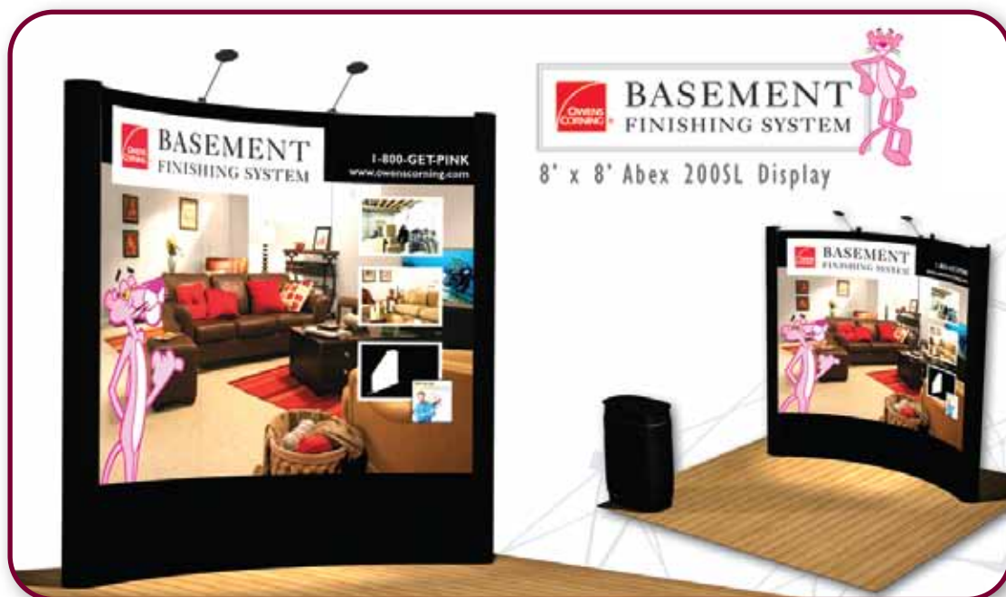
3D rendering of initial conceptual design

Keystone Displays knew that the Abex pop-up display would be an effective, durable, lightweight and portable solution for any environment.