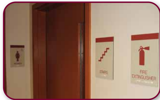
Interior wayfinding signage (ADA compliant)

Keystone Displays efficiently managed the manufacturing and installation of The Americans with Disabilities Act (ADA) compliant interior wayfinding signage for three multi-level campus buildings and their exterior aluminum signage.