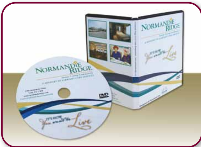
Branded case & DVD

The open house at Normandie Ridge was a huge success. All in attendance of the celebration, including members of the staff, current and prospective residents, found the video presentation to be very impressive and delivered a personal message. Without the use of this video technology, the impact of the event would not have been as strong or successful.