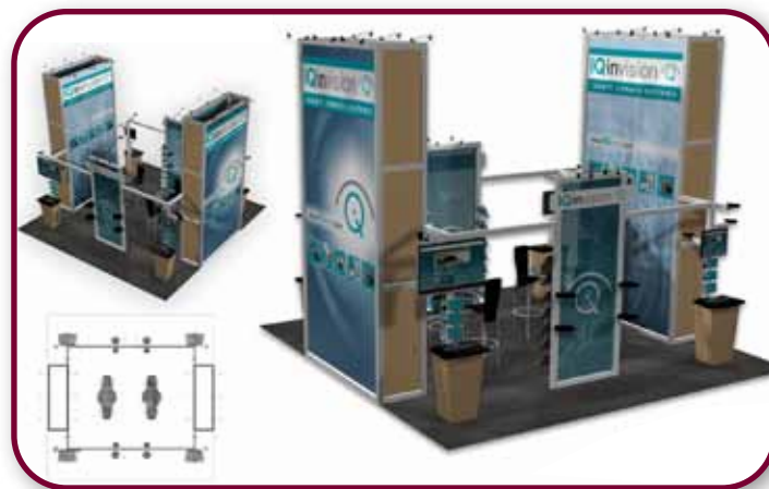
3D rendering of initial conceptual design

IQinVision, an innovative leader in the high-resolution and network camera industry, found a need to tower over their competition at a series of nationwide technology expos. Keystone Displays participated in a formal bid that included several other exhibit companies from across the country. The bid featured a list of "must-haves" that IQinVision's marketing department needed to accomplish with this new display. Keystone Displays found a way to address and solve every one of them, and still managed to come in under their budget.