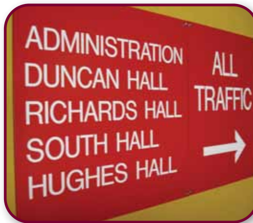
Aluminum parking garage signage