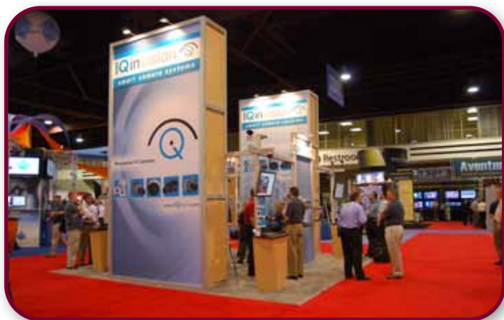
Final design, display at show