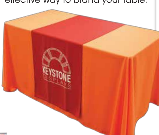
Table Runners are a simple yet effective way to brand your table.

Table Throws complete your space by coordinating with your display to give maximum impact to your overall presentation.